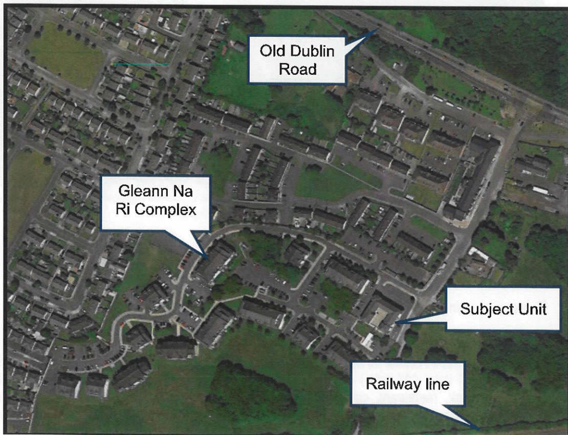
Figure 1: Aerial View showing location and context of Subject Unit.

The subject site is located to the east of Galway City at the Gleann na Ri Residential Complex at Murrough. The complex is located south of the Old Dublin Road and north of the Galway-Dublin Railway Line. The subject unit is located within Ti Choinn Building to the east of the complex, which also has also been identified as Block D or Block 14 in the course of the Planning History. The subject unit is located along the south-eastern frontage of this entrance building, fronting onto the main approach road. A large expanse of undeveloped land is located south of the Railway Line and is earmarked for future development as part of a Murrough Local Area Plan (LAP).