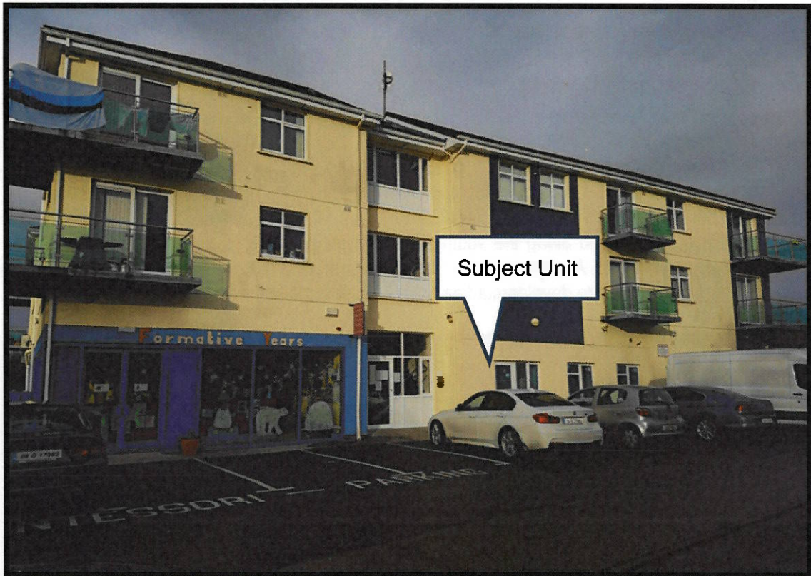
Figure 2: Photo (December 2018) showing the completion of the proposed external alterations to the building, which is materially different to the "shopfront" of the adjoining Creche.

On 17 th August 2018, a Section 5 application was made by a Tom King to the Planning Authority seeking confirmation as to whether or not a proposed conversion of ground floor offices at Ti Chionn, Gleann Na Ri, for use as a 2 bed apartment the applicant constituted exempted development. Subsequently, on 7 th September 2018, the Planning Authority made a Declaration that the proposed change of use is not considered exempt from planning permission. In turn, a Section 5(3) Referral was made by the applicant to An Bord Pleanala. However, it should be noted that the applicant did not await the Decision of Planning Authority, and has proceeded with the works on site, which are now nearing completion at the time of writing (See Figure 2 below).